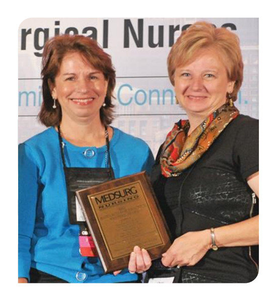
2011 MedSurg Nursing Journal Research Publication of the Year