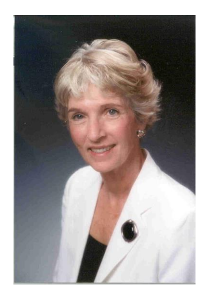
Suzi Burns Clinical Nursing Research Award