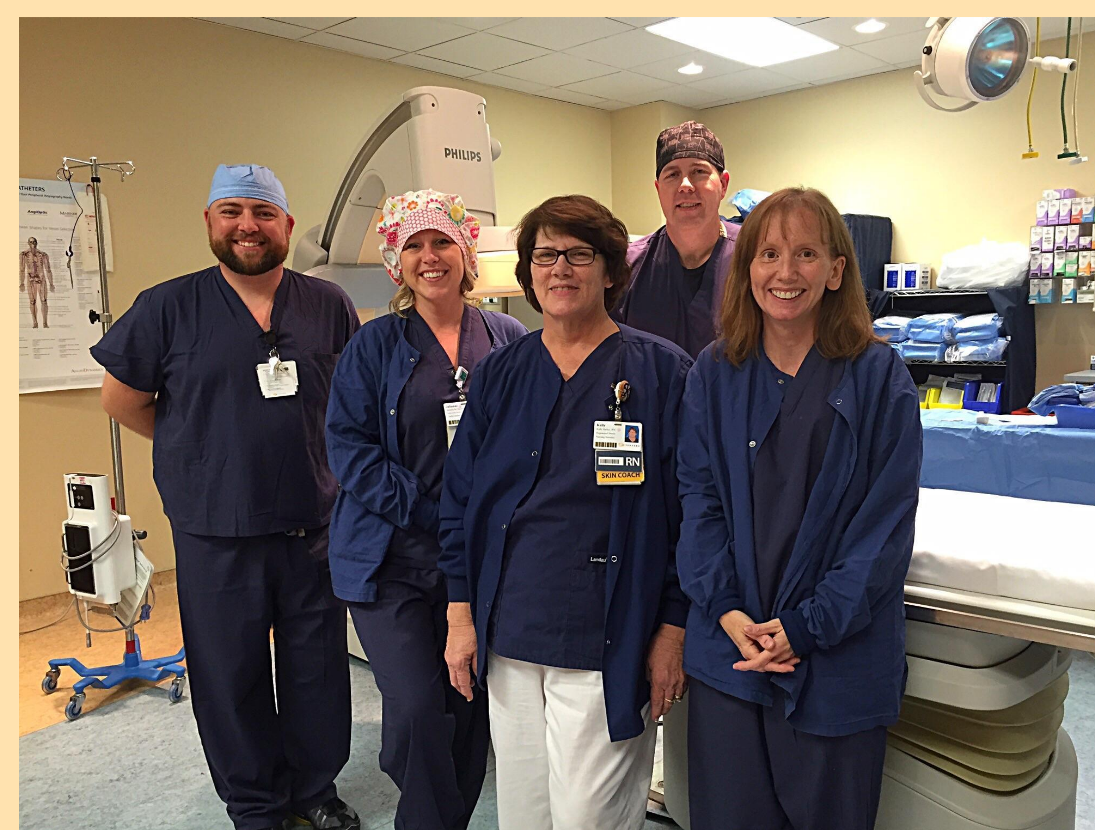
Members of the Cardiac Catheterization Lab Team at SWRMC