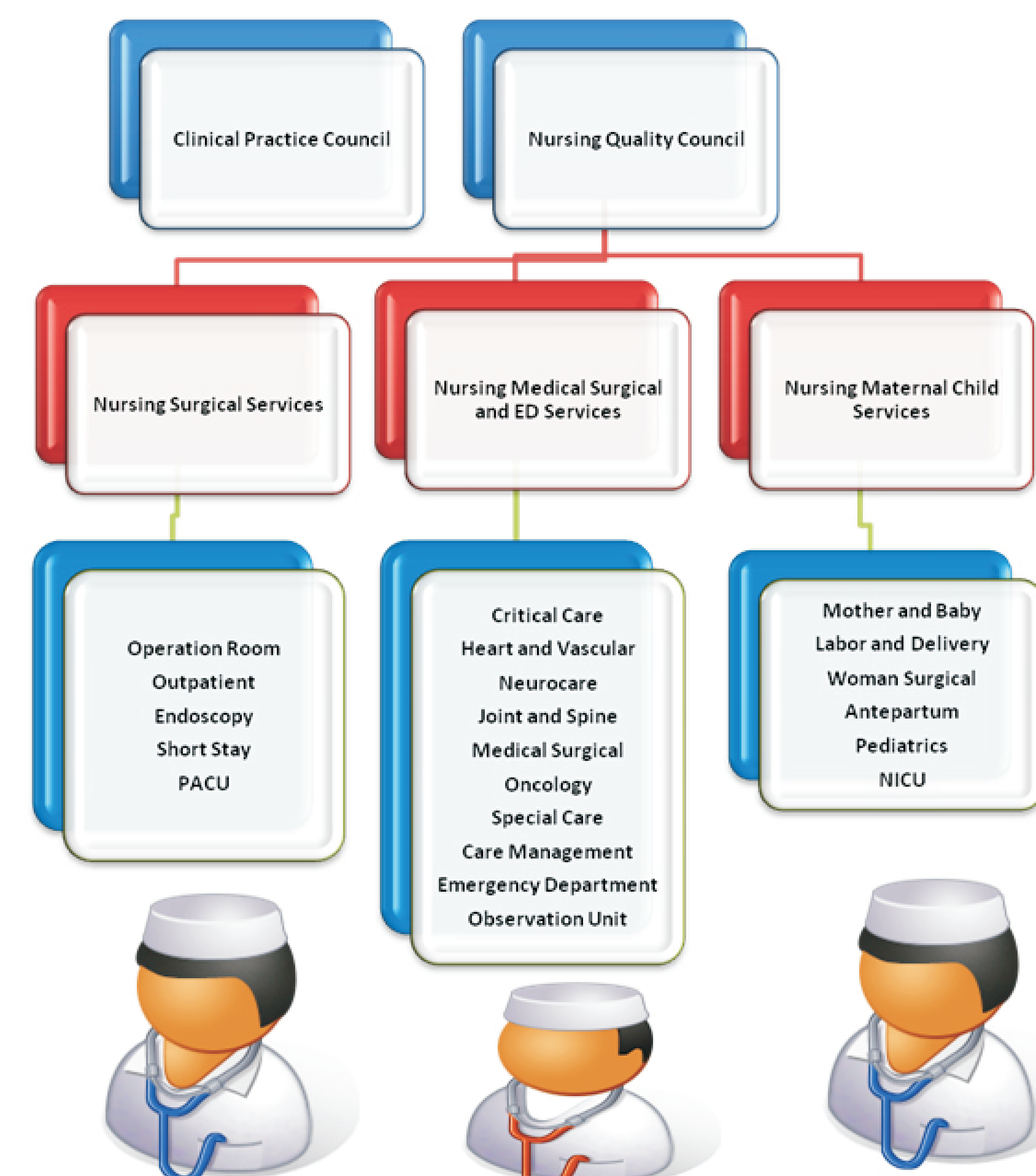
Staff Nurse Influence Over Practice

Complex nursing quality and safety problems cannot be successfully addressed within a healthcare system without a robust quality structure to support on-going quality improvement initiatives.