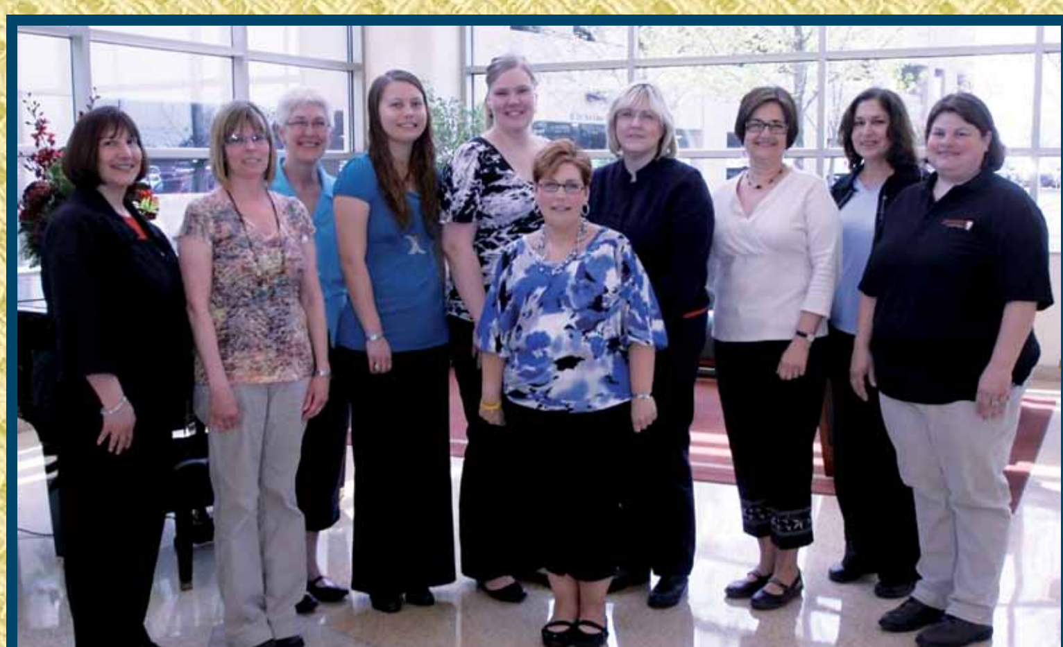
2010 Professional Development Council