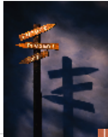
Eye on the Future