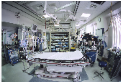
Ahead of the Curve